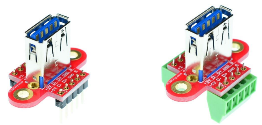
Figure 3: USB3-AF-BO-V1AV Various connections